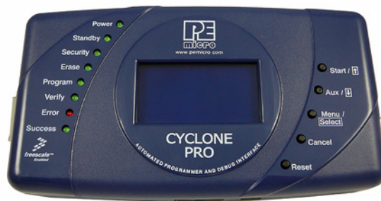
P&E's Cyclone PRO

The USB BDM MULTILINK is intended for development and is not designed to accommodate the demands of production programming. However, P&E's Cyclone programmers are specifically engineered to withstand the rigors of a production environment and will provide a seamless transition from the USB BDM MULTILINK. More information is available at: http://www.pemicro.com/cyclone