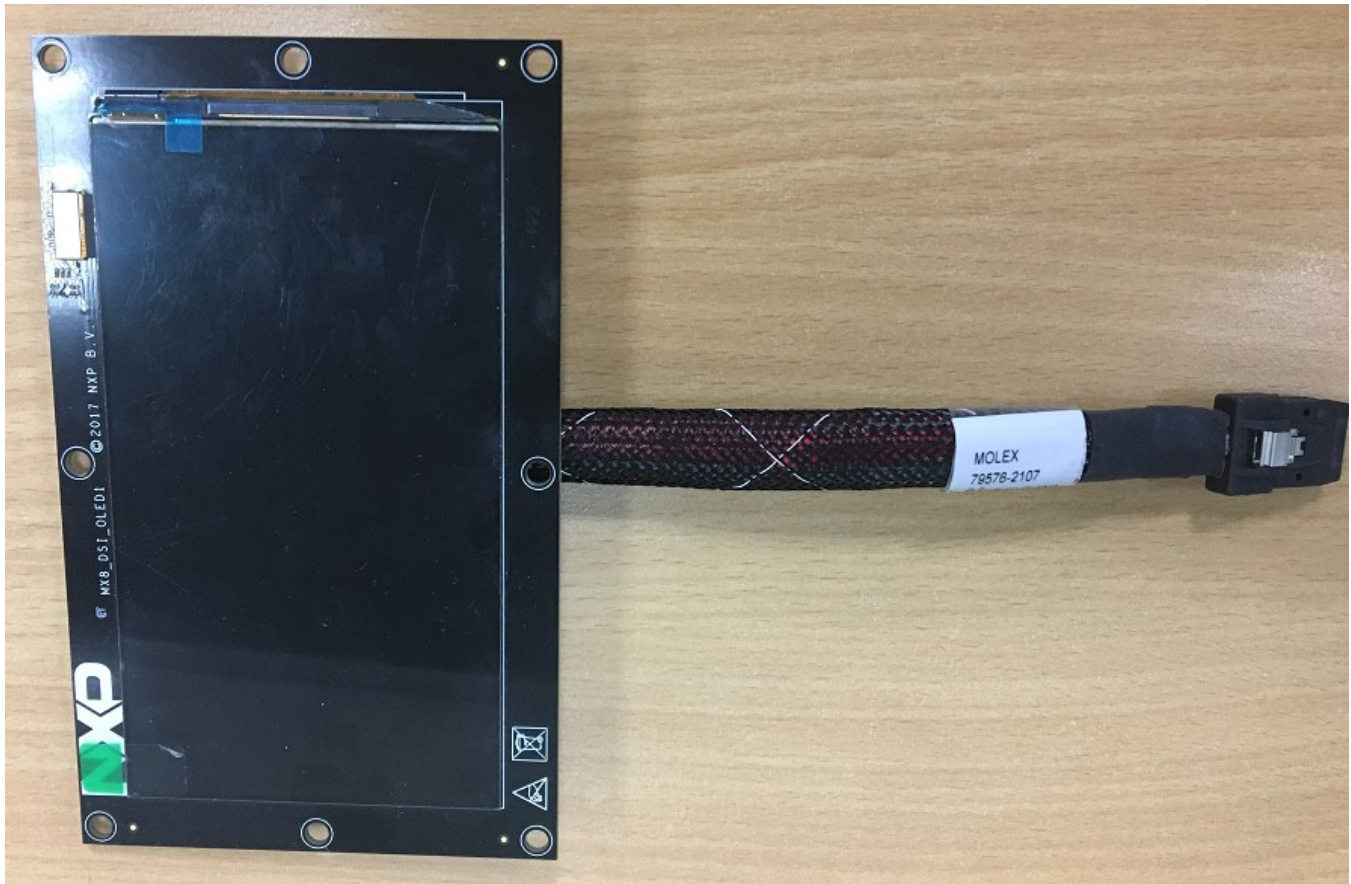
Figure 4. i.MX MIPI panel