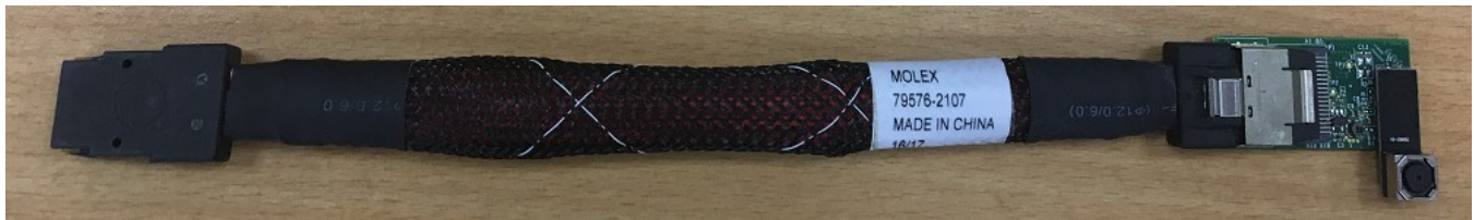
Figure 5. i.MX MIPI camera