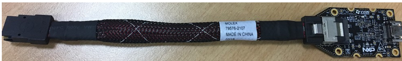
Figure 2. i.MX mini SAS cable with DSI-to-HDMI adapter