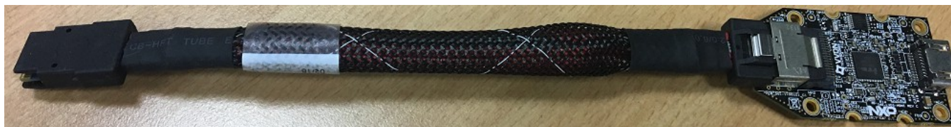
Figure 3. i.MX mini SAS cable with LVDS-to-HDMI adapter