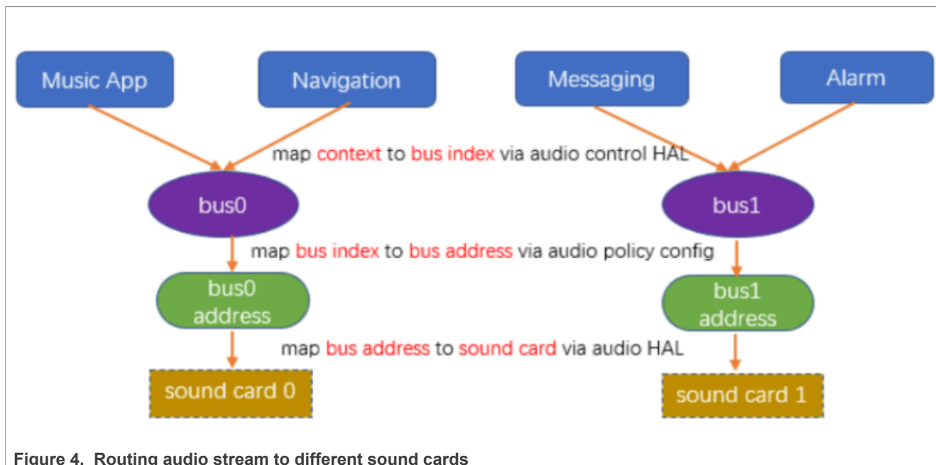
Figure 4. Routing audio stream to different sound cards