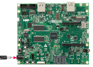
Figure 3: MIMXRT1170-EVK Power Adapter Cable to 5V DC In Header (J43)