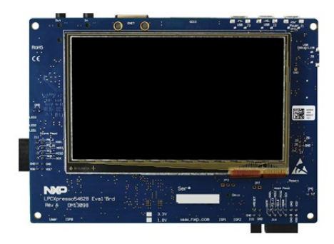
LPC54628 (OM13098) Development Board