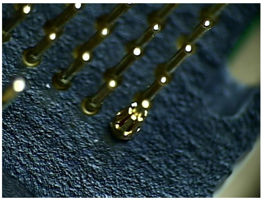
Close-up of pin socket left behind from Pin Protector Shroud removal.

This piece must be removed prior to installing device in your target! Use tweezers to remove pin socket.