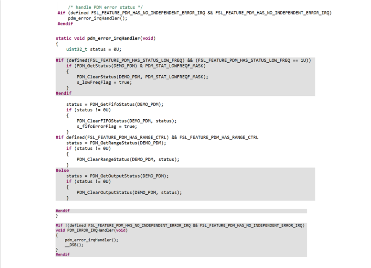
Figure 6. Example code of the PDM interrupt service routine in case of error detected

The example mcxn5xxevk_pdm_interrupt can be found in the MCUXpresso SDK for MCX Nx4x at <SDK_<pre>LOCATION>\boards<board_name>\driver_examples\pdm\.