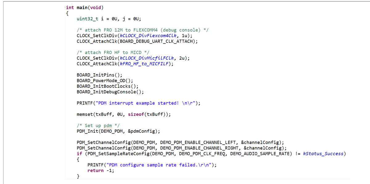
Figure 3. Example code to initialize PDM peripheral and channels

• PDM initialization: PDM peripherals, PDM channels, PDM divider by writing to the CTRL_1 register.