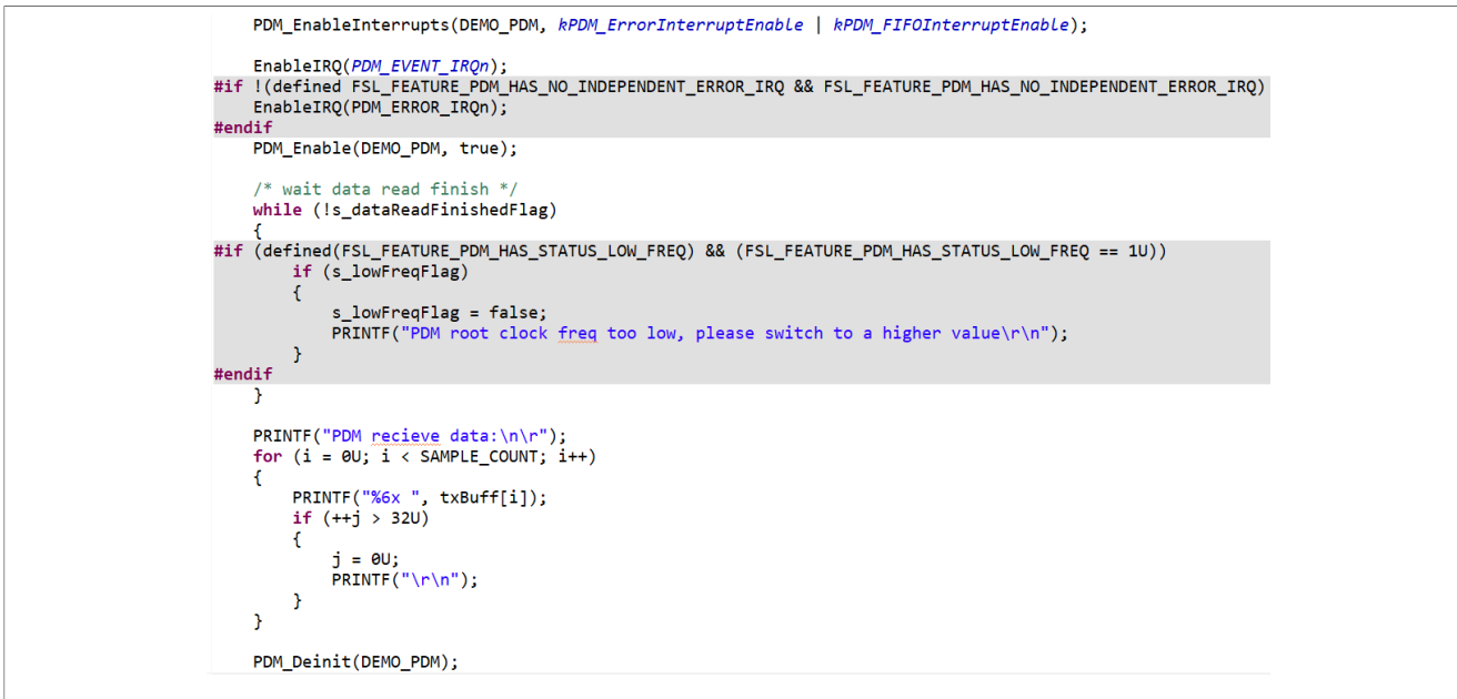
Figure 4. Example code to enable PDM interrupts

• Implement PDM interrupt service routine.