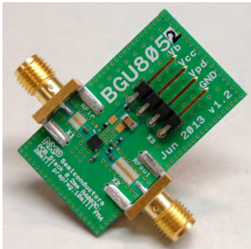
Fig 1. Evaluation board that has been used.

The measurement results that have been carried out for this application are not measured on the standard 1900MHz BGU8052 evaluation boards. This evaluation board is fully described in AN11416 . This includes detailed information about the product, schematic, Layout and BOM. It also includes ordering information.